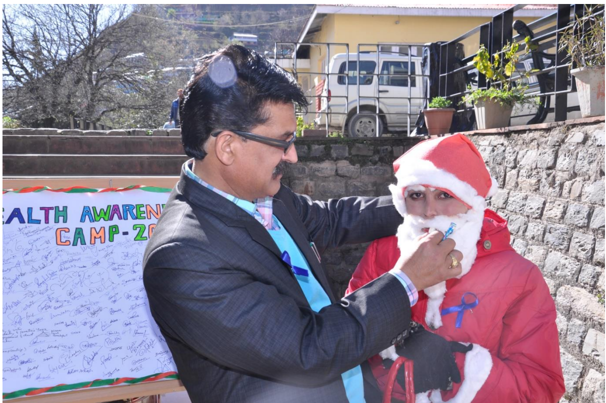
MASCOT OF THE CAMP-SANTA