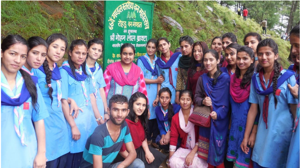
Tree Plantation Drive in collaboration with HP Forest Deptt. Rohru