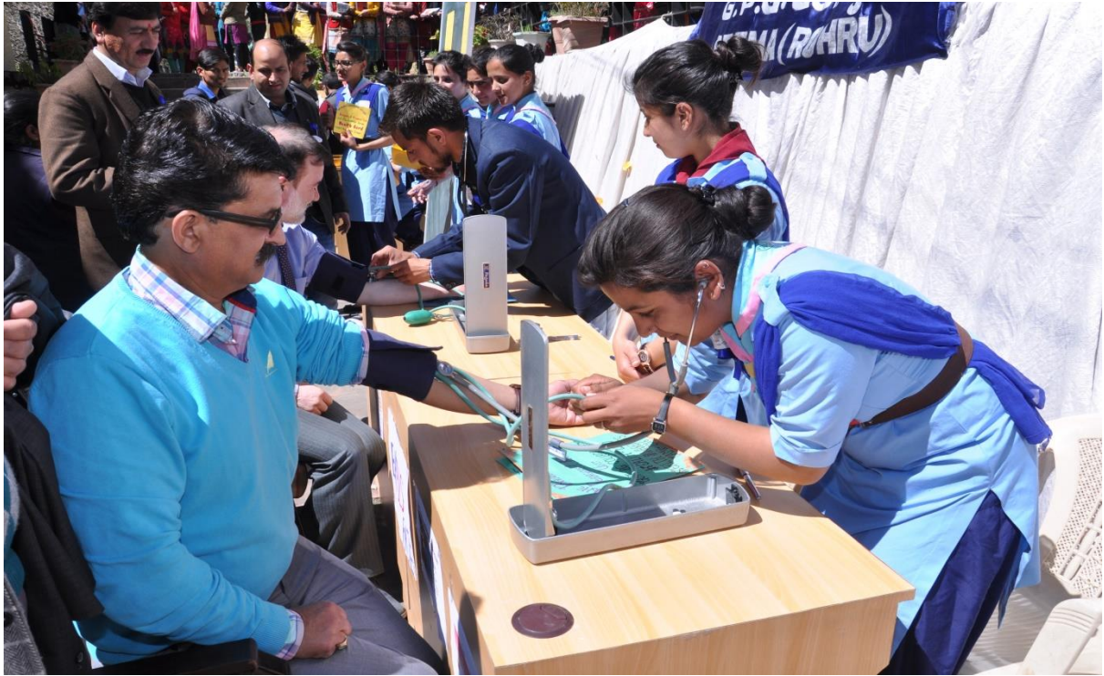
RECORDING OF BLOOD PRESSURE