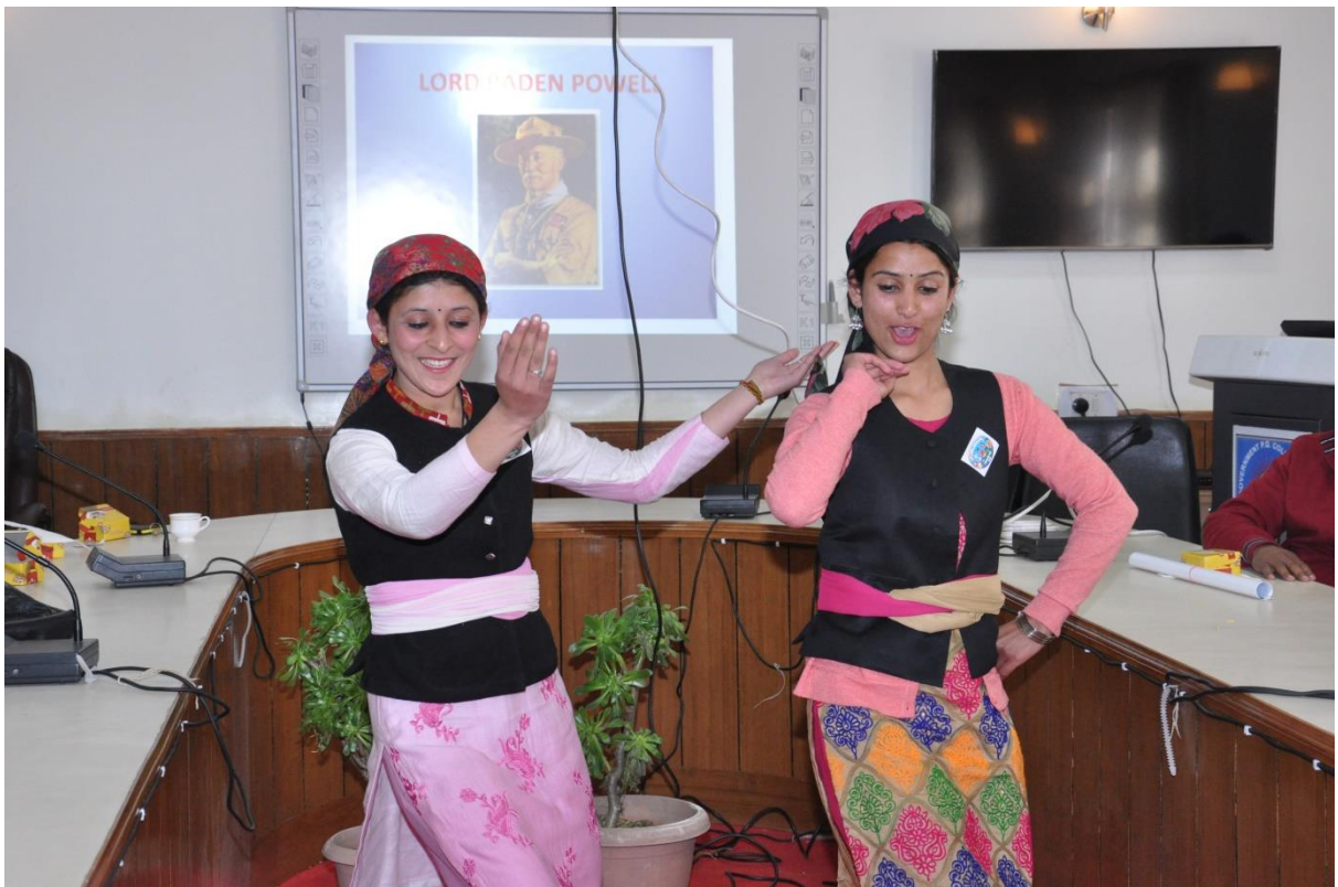
Performing on Pahari Folk Song