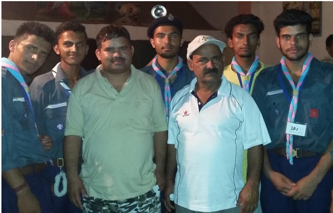
Rovers with Instructors