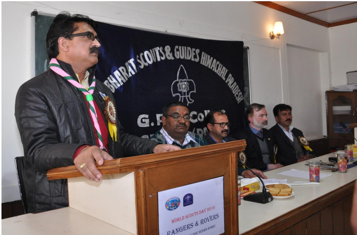
ADDRESS BY CHIEF GUEST