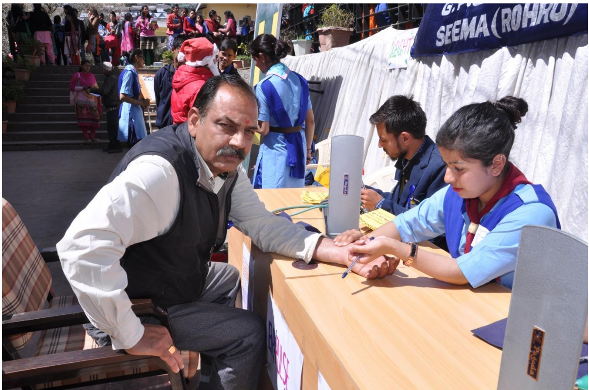
RECORDING OF PULSE