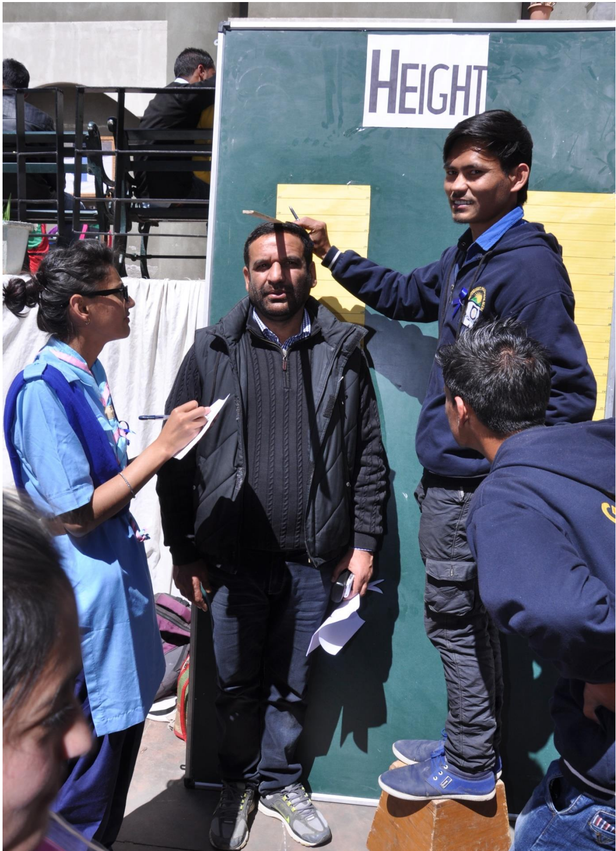
RECORDING OF HEIGHT