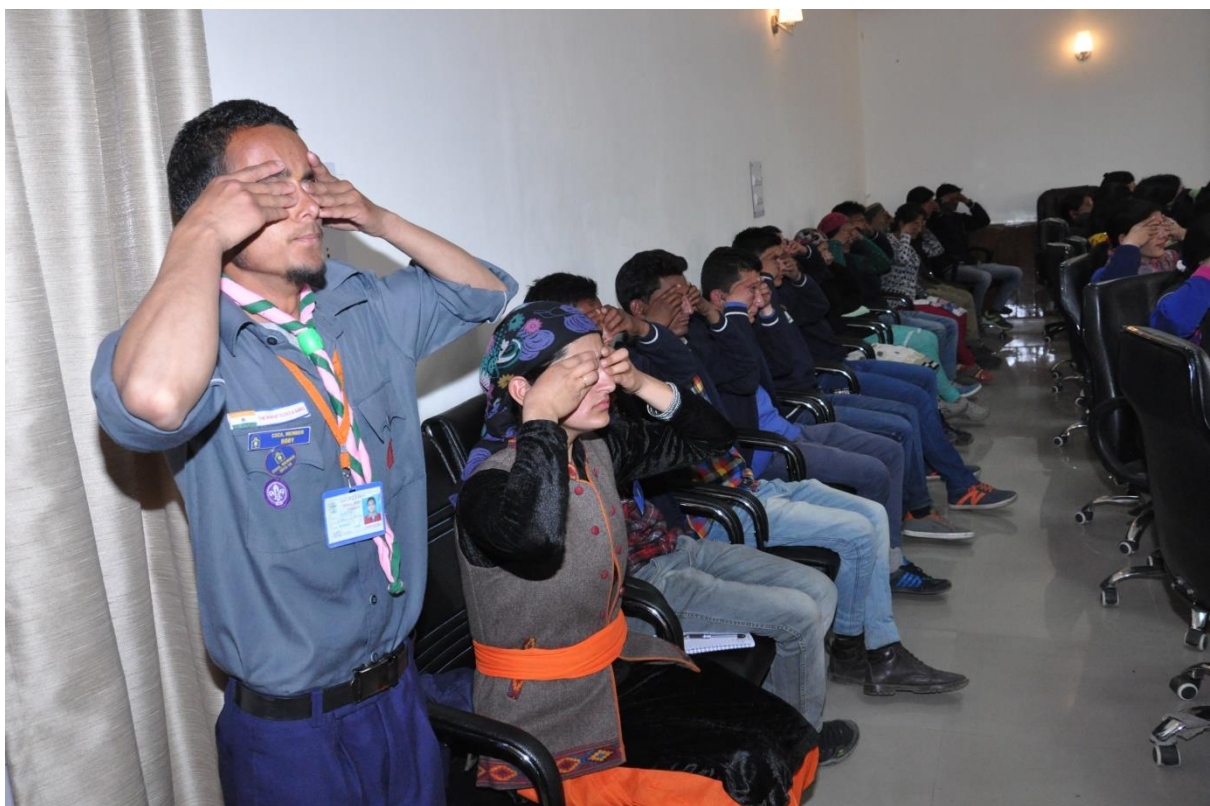
Practical Yoga Session