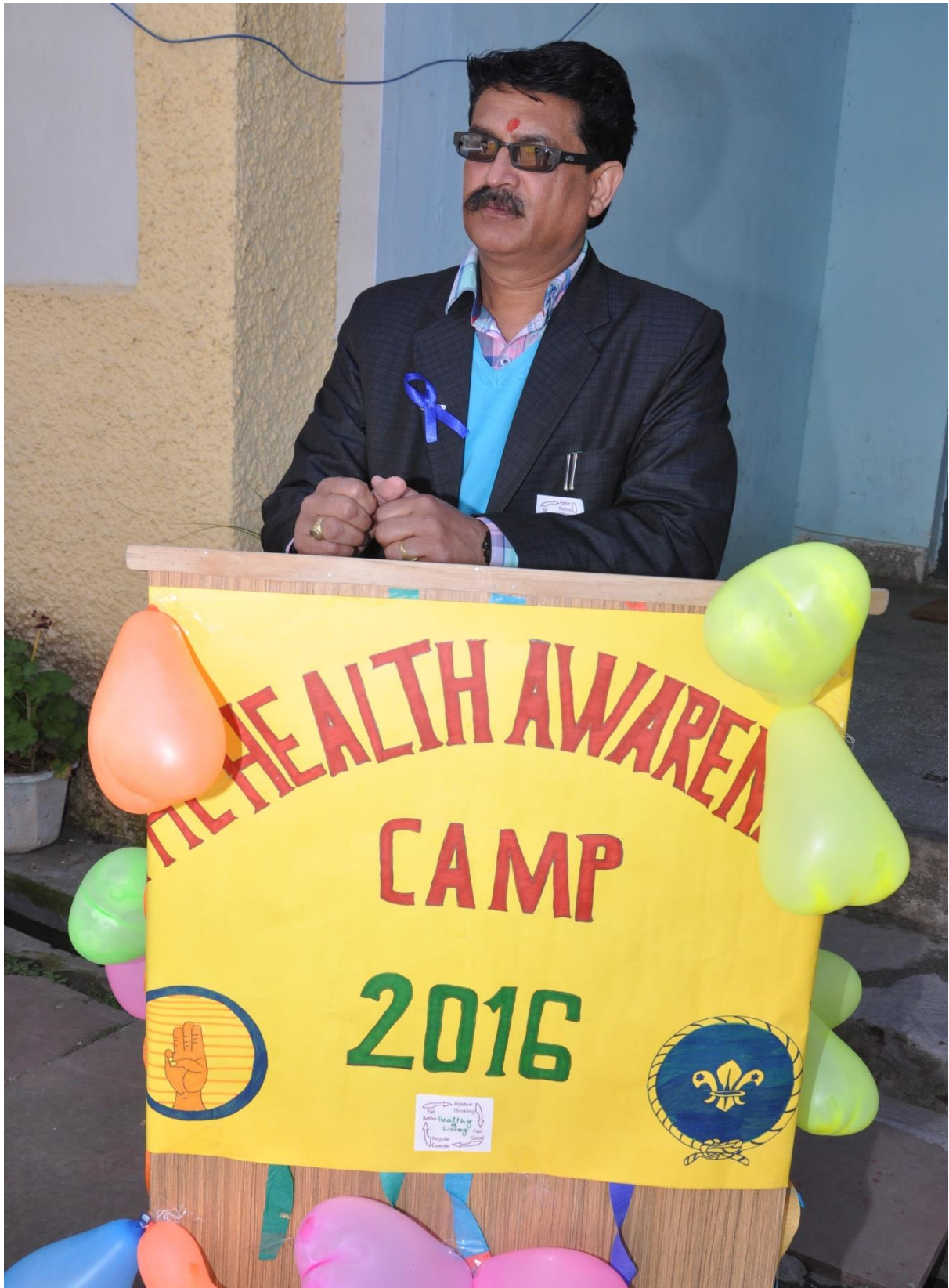
ADDRESS BY CHIEF GUEST (PATRON-RANGERS & ROVERS)