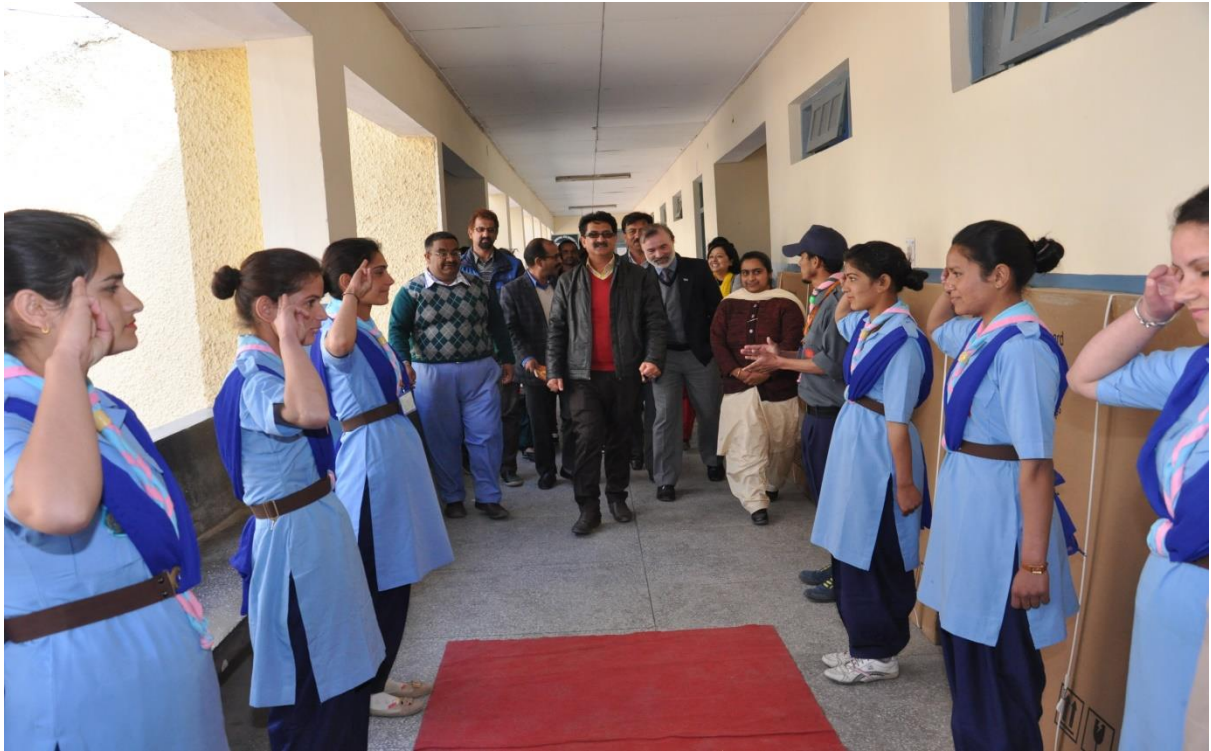
RECEPTION OF CHIEF GUEST