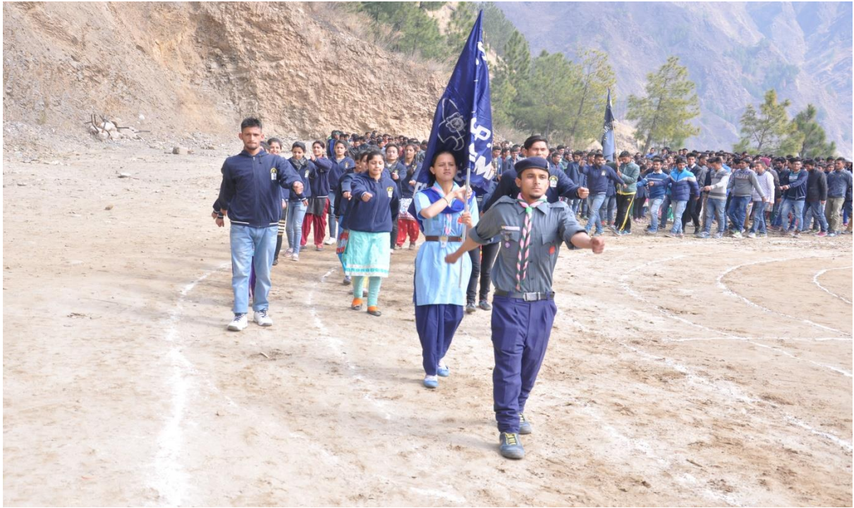
MARCHPAST (COLLEGE ANNUAL ATHLETIC MEET)