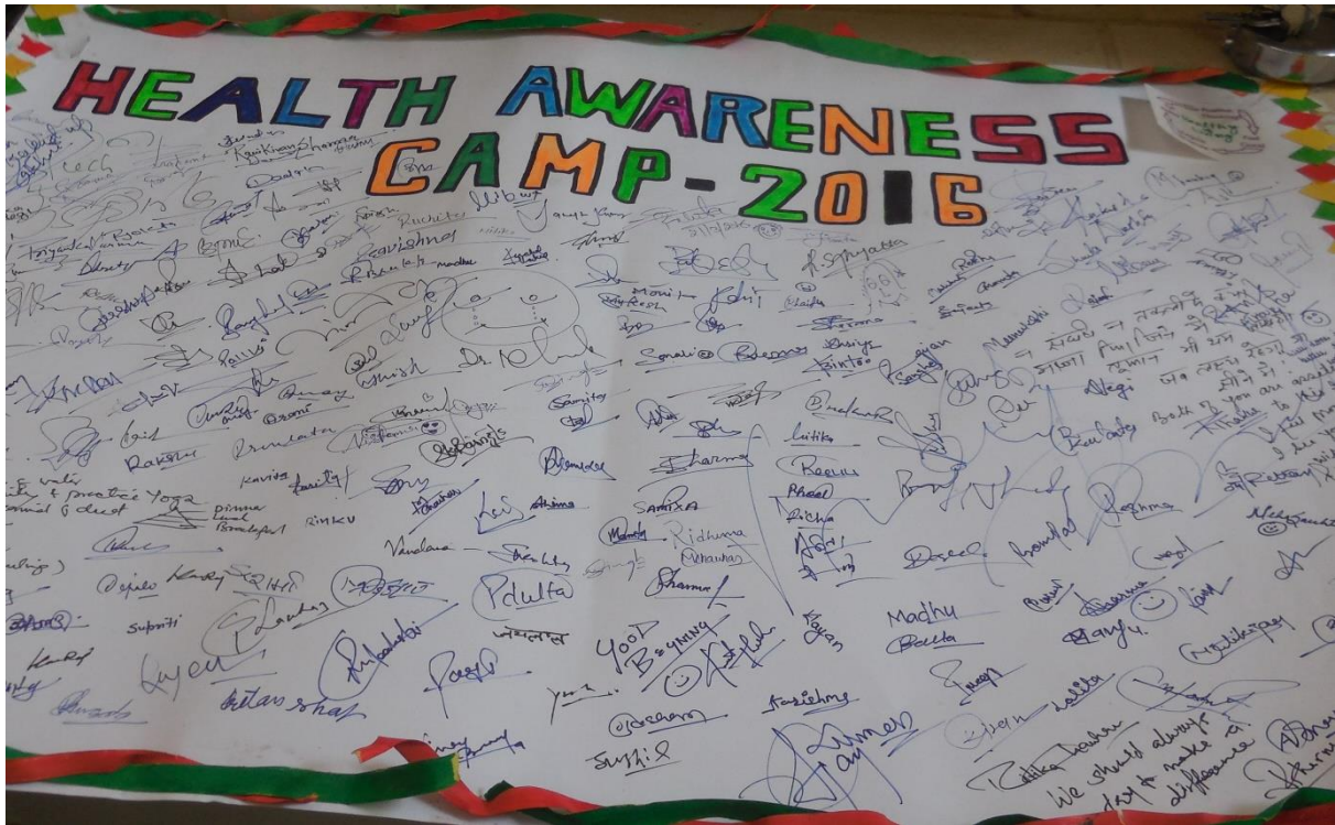
SIGNATURE CHART FOR PLEDGE