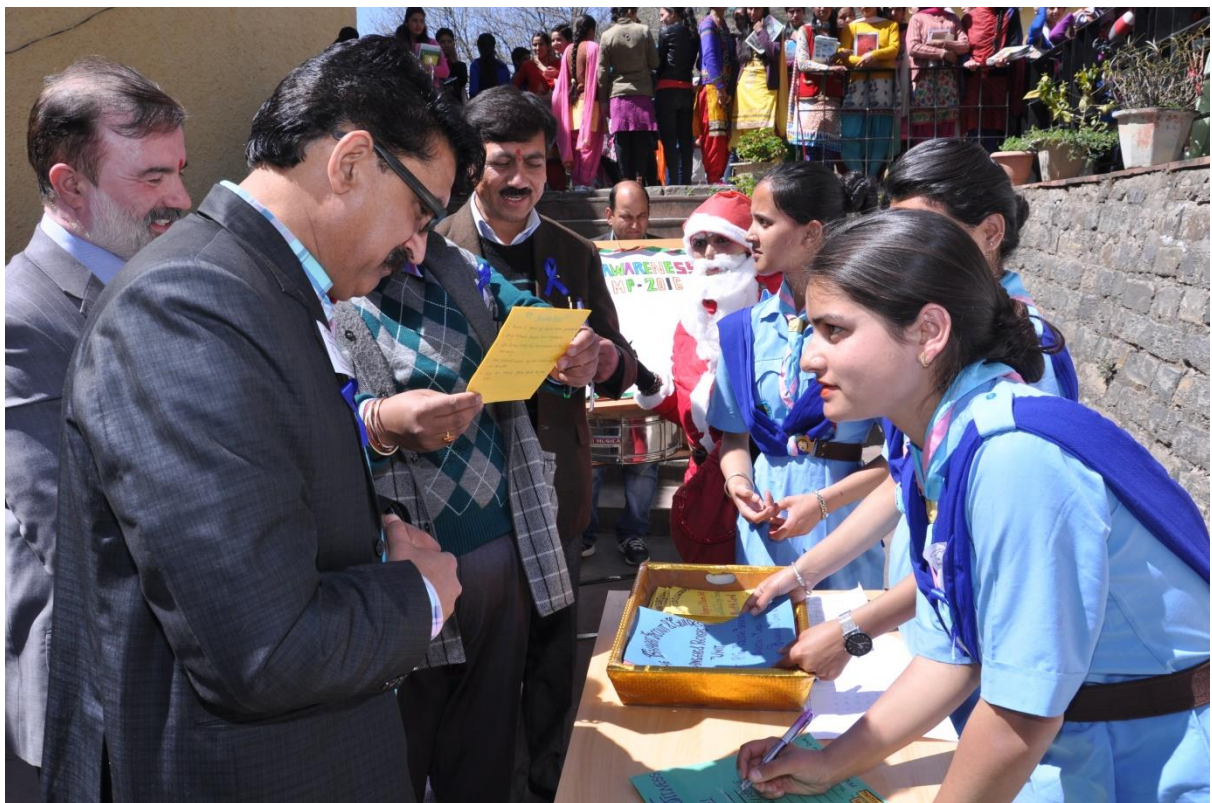
REGISTRATION FOR CAMP