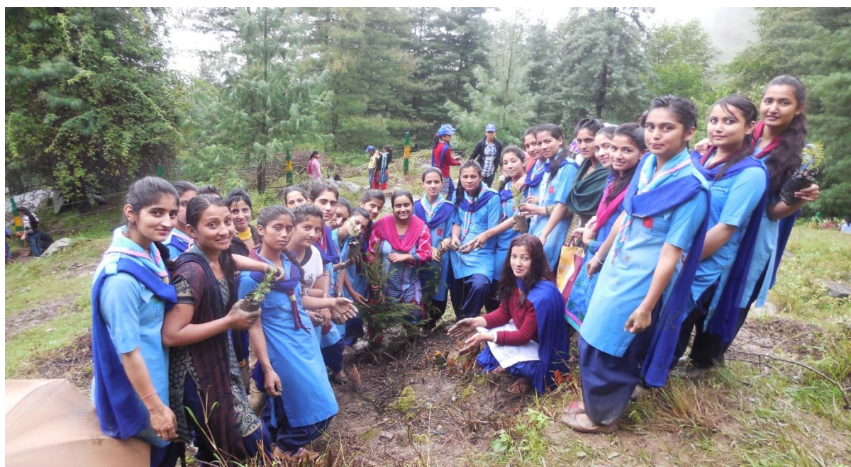
VanMahotsav at Bartu. Rantari Panchayat