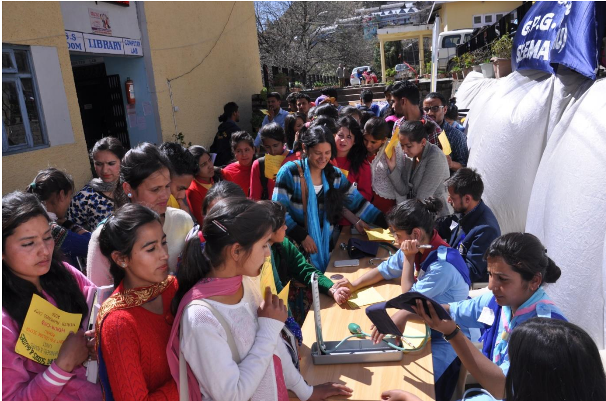
STUDENTS EAGERLY WAITING FOR THEIR TURN