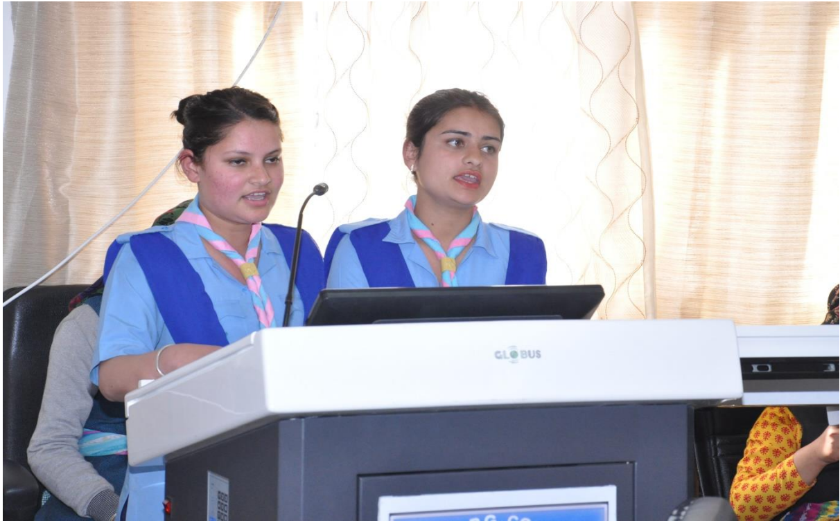
Theme Song on Women Empowerment