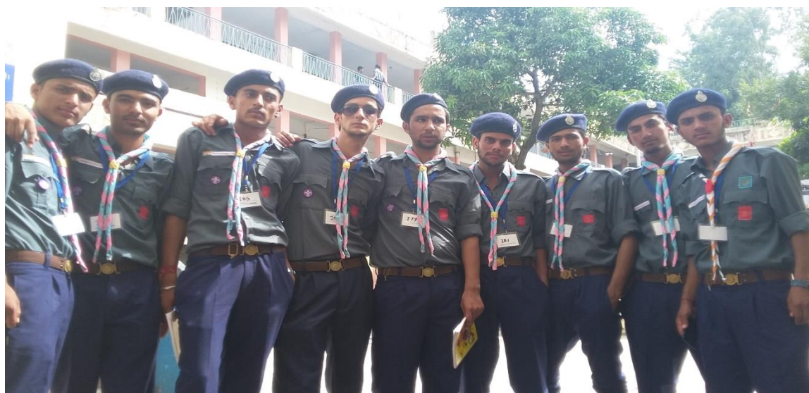
Rovers at Shahtalai, Bilaspur