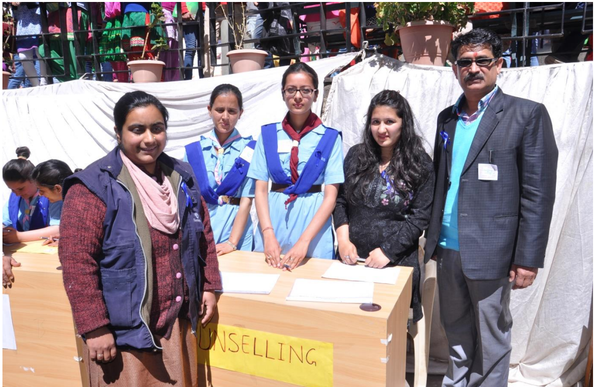
COUNSELLORS WITH CHIEF GUEST